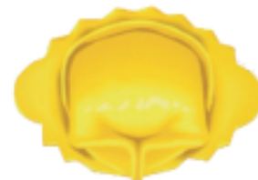
C 11 TA