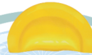
R 07 TA