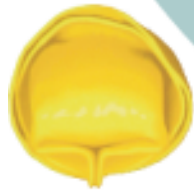
C 15 TA