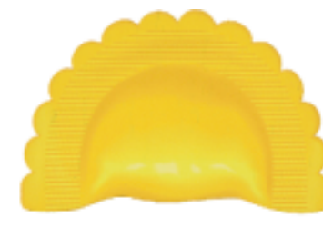
R 27 TA