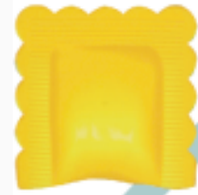
R 22 TA