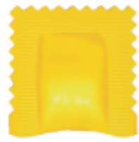
R 18 TA