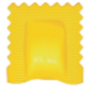
R 43 TA