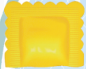
R 23 TA