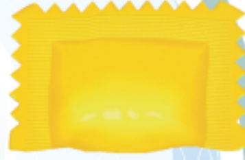
R 46 TA