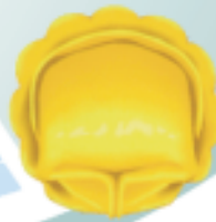
C 12 TA