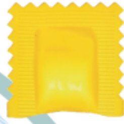
R 69 TA