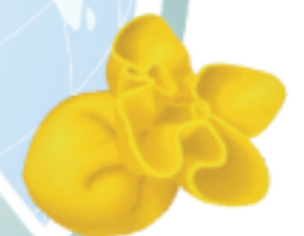
S 02 TA