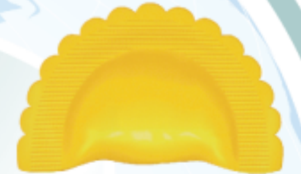
R 29 TA