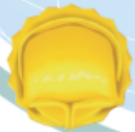
C 31 TA