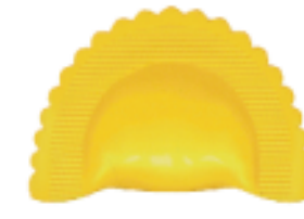
R 34 TA