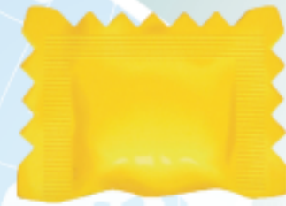
R 13 TA