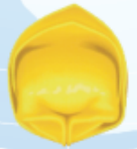
C 14 TA