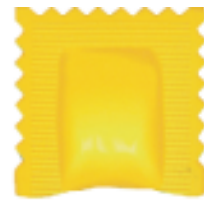
R 80 TA