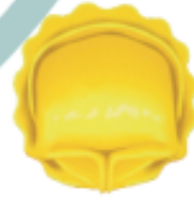
C 53 TA