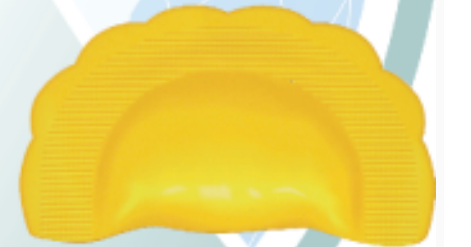
R 02 TA