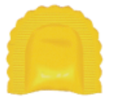
R 17 TA