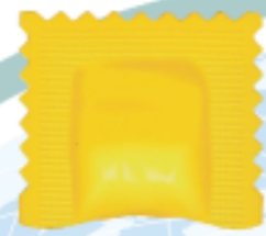
R 45 TA