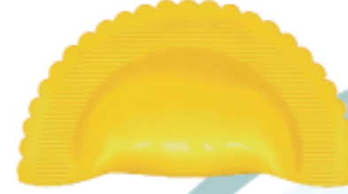
R 30 TA