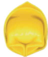
C 37 TA