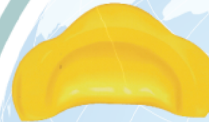
R 03 TA