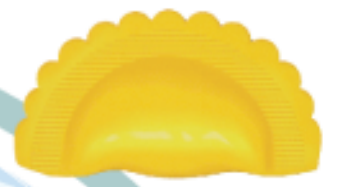
R 10 TA