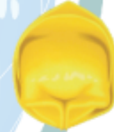
M 38 TA