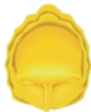
C 77 TA