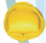
M 65 TA