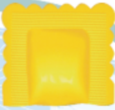
R 19 TA