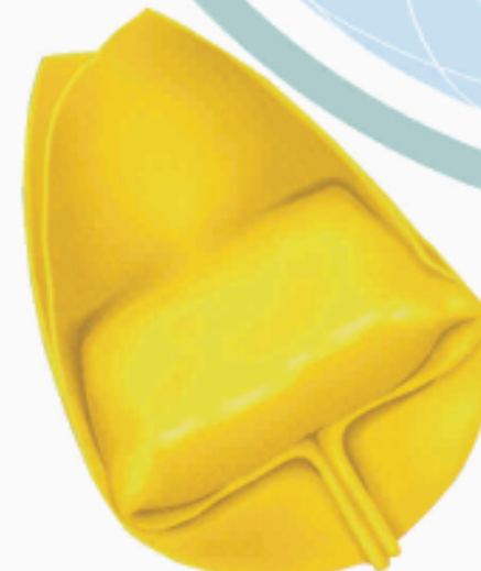
T 59 TA