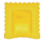
R 20 TA