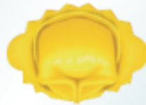
M 50 TA