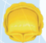
M 40 TA