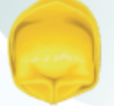
M 41 TA