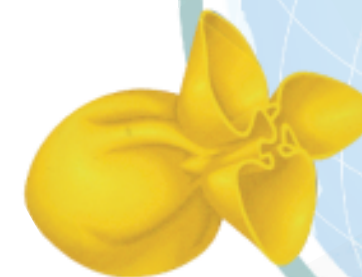
S 03 TA