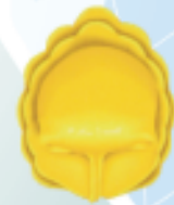
M 64 TA